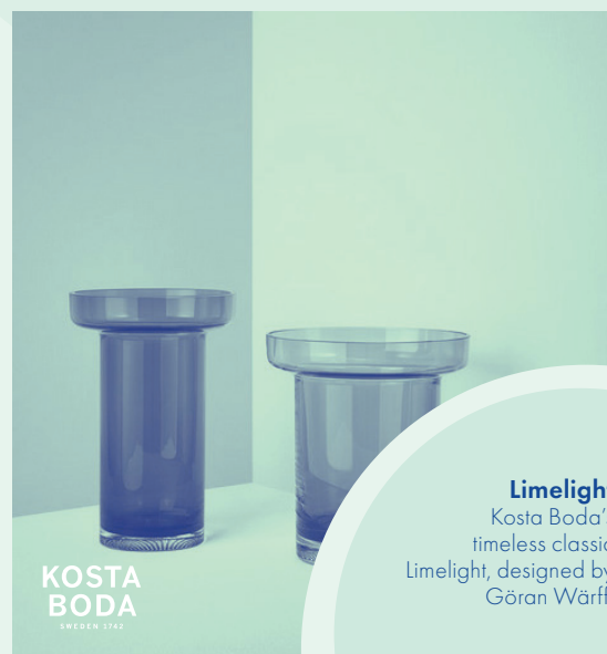
Limelight Kosta Boda's timeless classic Limelight, designed by Göran Wärff.

Result for the period improved by SEK 104.6 million and amounted to SEK 67.7 (-36.9) million. Earnings per share amounted to SEK 1.04 (-0.54) .