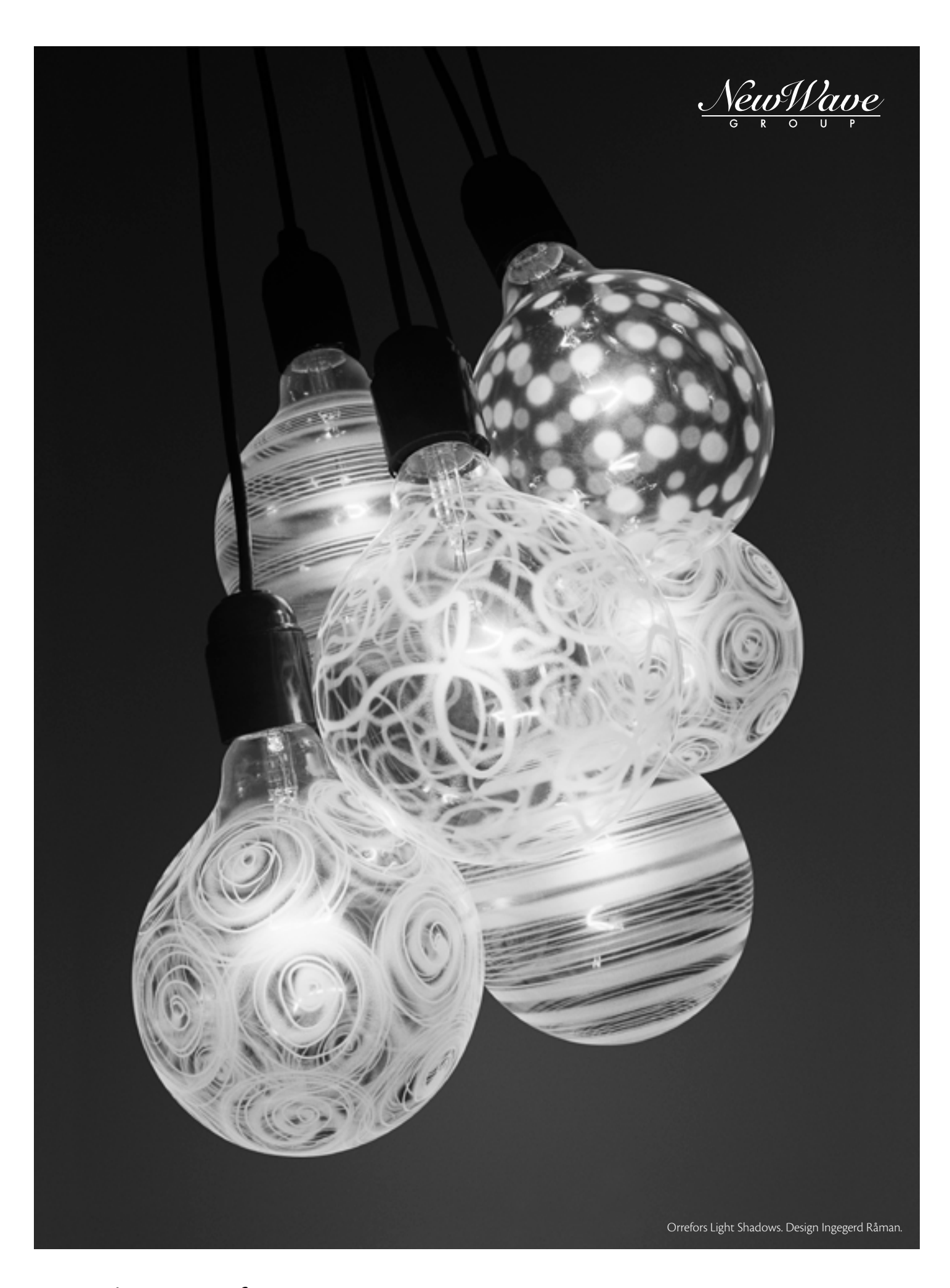
Interim Report for New Wave Group AB (publ) Q2 JANUARY - JUNE 2009